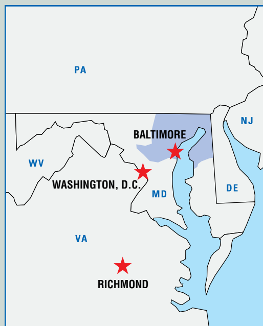
Baltimore City and Baltimore, Cecil, Harford, Howard and Kent counties.

Funding for Maryland Civil War Trails has been provided, in part, by the Federal Highway Administration through